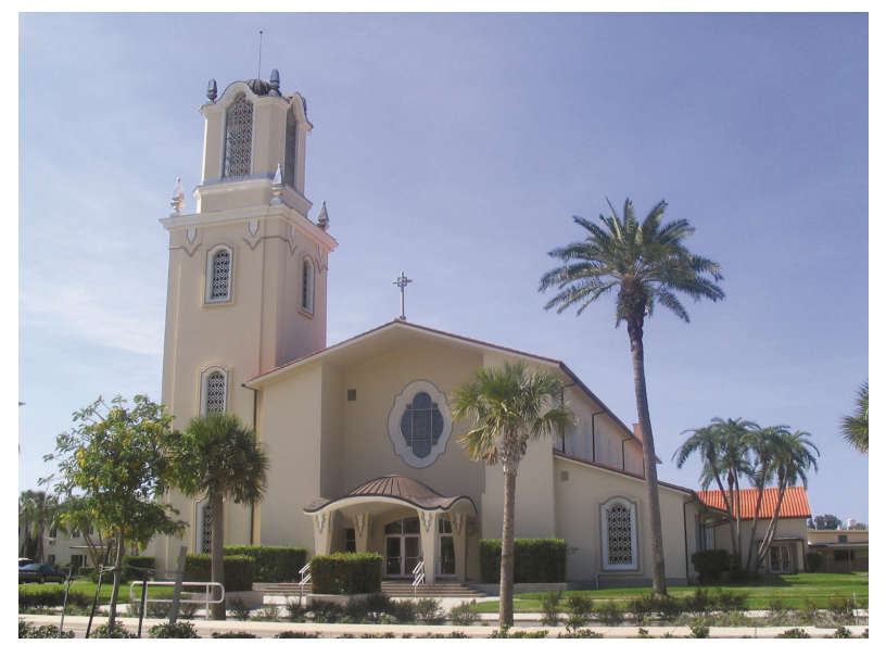
—Sixty–nine years of sharing The Living Eucharist daily.